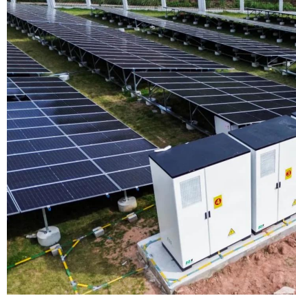
5G Power: Creating a green grid that slashes costs, ...

Technicians from China Mobile check a 5G base station in Tongling, Anhui province. China aims to build over 4.5 million 5G base stations...