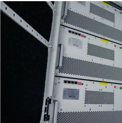
Italy Energy Storage Systems Market , 2019 - 2030 , Ken ...

Italy sustainable energy storage systems market valued at USD 2.3 Bn, targeting 11 GW by 2030, driven by renewables integration and government incentives like MACSE.