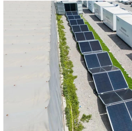
Power Kyiv , Infrastructure development Ukraine

Infrastructure Development Ukraine - Energy project financing Ukraine: Power Kyiv is transforming Ukraine's energy with resilient, clean infrastructure. Our 1 GW project combines ...